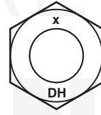
A 563 Grade-DH