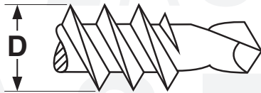
Fine Thread Drill Point Drywall Screw